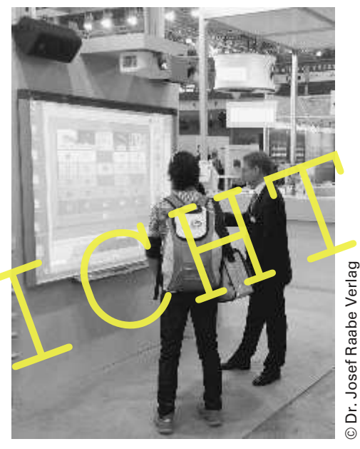
Besonders auf Messen ist es wichtig, die Produkte und Dienstleistungen des eigenen Unternehmens auch auf Englisch vorstellen zu können.

In einem unabhängig einsetzbaren Zusatzbarstein beschäftigen sich die Lernenden mit Gründen für Deutschlands Exportstärke.