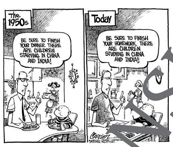
© CARLSON © 2005 Milwaukee Journal Sentinel. Replinted with permission of ANDREWS MCMEEL SYNDICATION. All rights reserved.