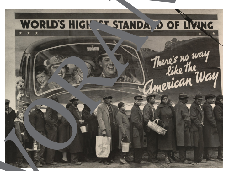
© Image Rourke-White, found at: <a href="https://www.sartle.com/media/artwork/at-the-time-of-the-louisville-flood-margaret-bourke-white.jpg">https://www.sartle.com/media/artwork/at-the-time-of-the-louisville-flood-margaret-bourke-white.jpg</a> [last access: 18/01/2023]