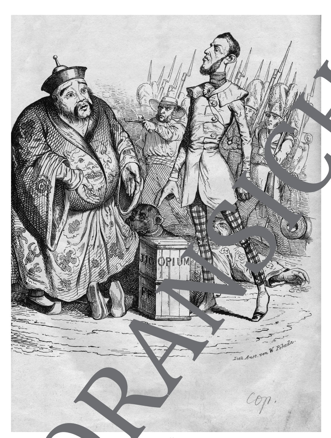
The English secure unres. \bigcirc d access \bigcirc opium trafficking through their military superiority. \bigcirc bpk