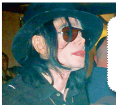
Michael Jackson, the 'King of Pop'