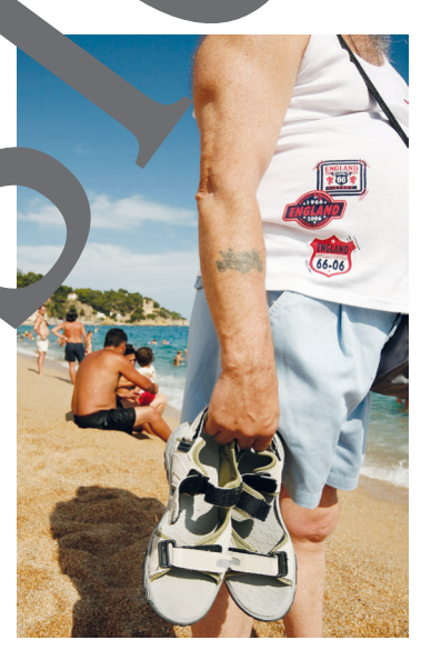
Brit on the beach

There are few phrases that strike as much fear into the heart of the international community as its abroad". Really, it's with good reason; as som one who personally suffered through a number of Though Cool package holidays in my youth and once visite and out of choice as a fledgling adult, I can st to the fact that even British people feel the fear. My own stand-out memories include licking a Mancunian teenager neck while dressed in a miniskirt in Fishbowl in Greece; and leaning over balcony at nine years old as my usually sedentary father rinted down a concrete staircase at 5 are en route to the control sun loungers by the pool with some wels, shouting, with a complete lack of irony, "W have w Germans, or it's all over." So not exac by elicate sunsets over white sandy beaches on Instagra